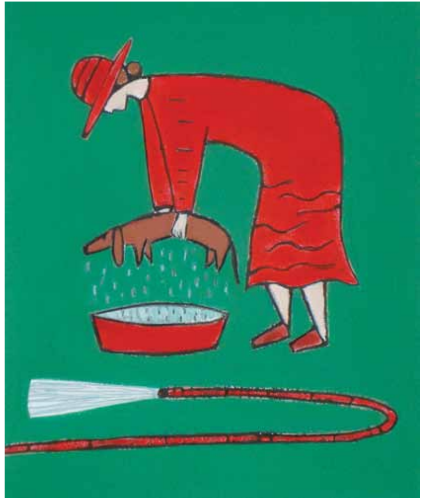
Linnea Lundmark, Dachshund Being Washed . Blockprint.